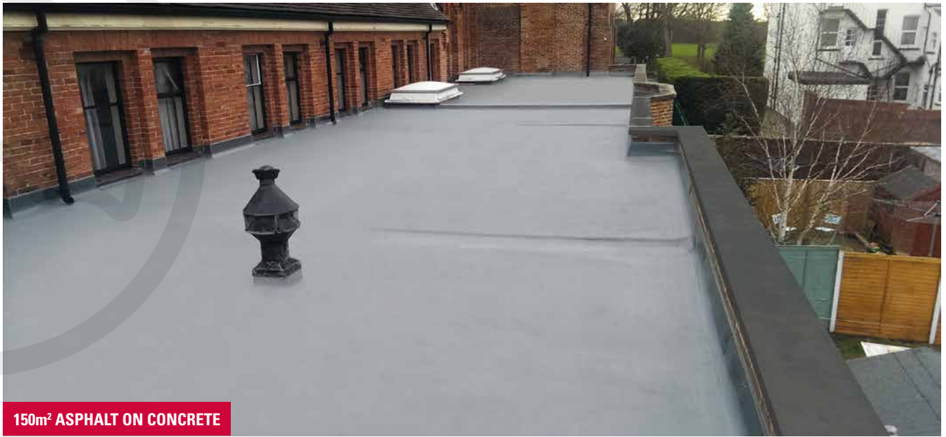
150m 2 ASPHALT ON CONCRETE